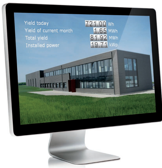
The overview option impressively displays the overall performance, the total yield or the amount of CO 2 emissions that have been avoided.

Separate portals, central administration: service providers, project companies or investors have the option to administer several WEB Commercial portals at the same time with the comfort of a single operator interface.