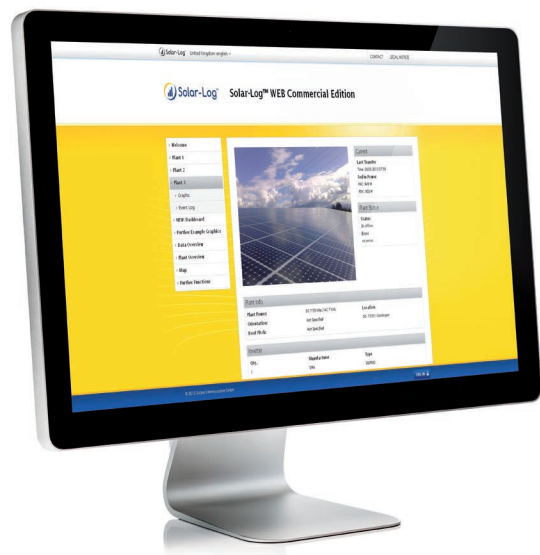
The data sheet provides an overview of the most important plant data such as location, performance and inverter details.